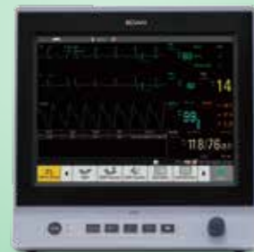
X series Patient Monitor